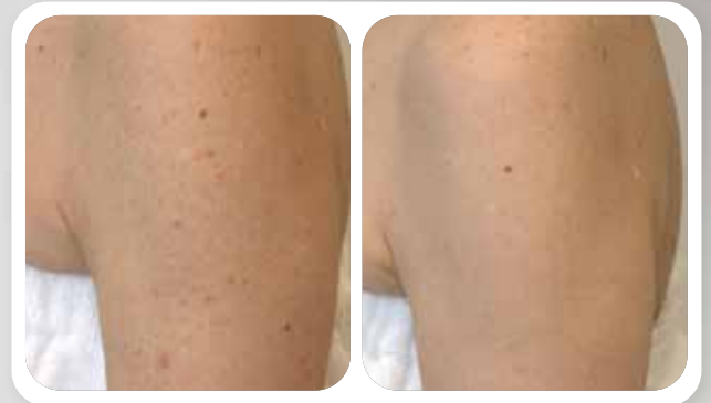
BBL® HEROic™ | post 2 treatments