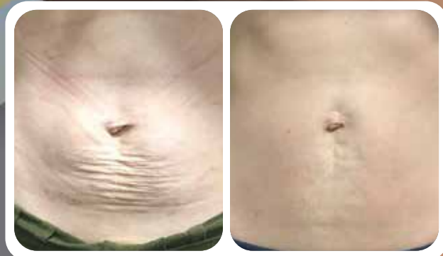
SkinTyte™ | 6 months post 5 treatments