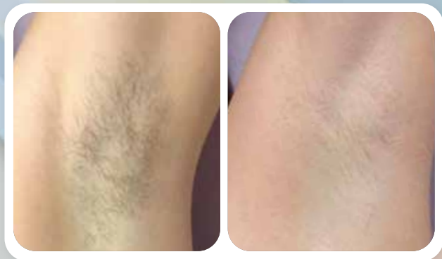
Forever BARE BBL® | 4 months post 3 treatments