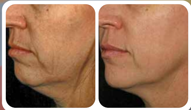
SkinTyte™ | 1 year post 5 treatments