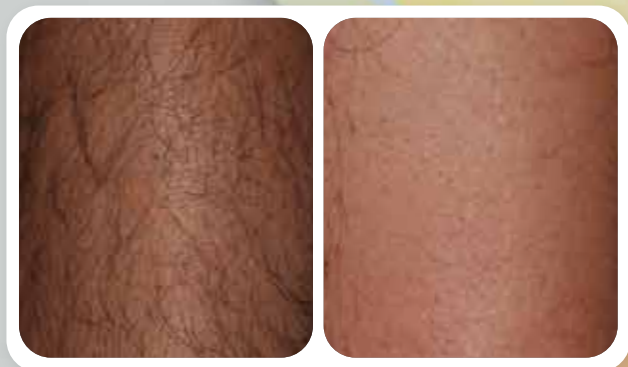
Forever BARE BBL® | 6 months post 3 treatments