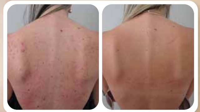
Forever Clear BBL ® | 9 weeks post 2 treatments