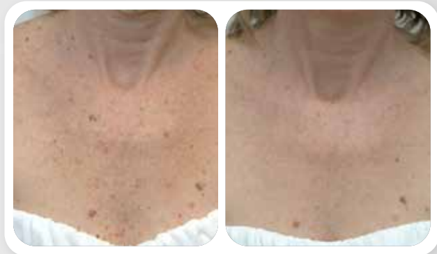
BBL® HEROic™ | post 2 treatments